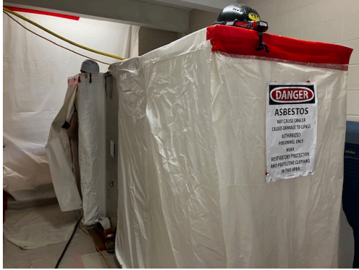
Asbestos containment enclosure and decontamination shower for abatement of the floor tile in the 1961 addition classrooms.

Demolition of the church balcony stairs began, but was paused due to discovery of concealed asbestos, that needs to be abated first. Additional concealed asbestos had also been encountered in the Fellowship Hall and several adjacent rooms.