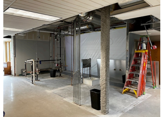
Concrete floor slab removed in the area of the new Fellowship Hall Toilets.