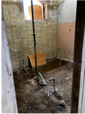
Work is underway on the new Toilets at the east end of the Second Level of the 2000 school addition.