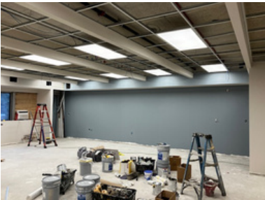
Wall painting is nearly complete in the classrooms on the second level of the 1961 addition. Each room will have an accent color on one wall of the room. The colors match those in the 2000 classrooms.