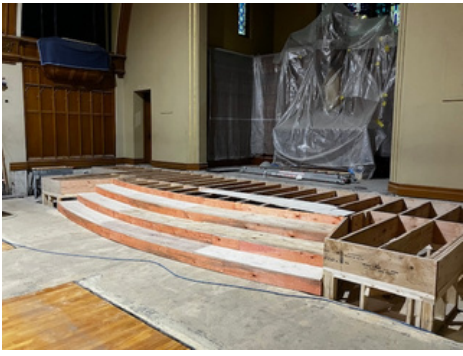
Workers have the framing for the new raised Chancel floor and steps nearly complete. The steps and raised floor will have maple flooring to match the pew area when finished.