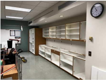
Olson Cabinets, who is making all of the cabinets for the project, has started installing cabinets on the second level of the 2000 addition. Since they were constructed 25 years ago, these classrooms never had cabinets or sinks.