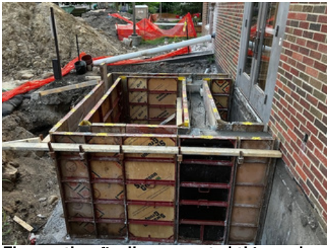
The weather finally cooperated this week and workers were able to pour concrete for the footings and foundation walls for the new Vestibule at the south entrance to the 1961 addition to the school.