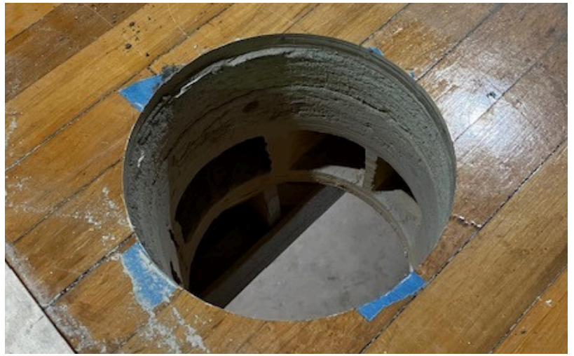
9 1/2" diameter holes are being drilled through the floor of the Sanctuary for installation of new supply air diffusers under the pews. Most air will still be supplied by the larger diffusers in the side aisles, but these diffusers will help provide a more uniform temperature throughout the space.