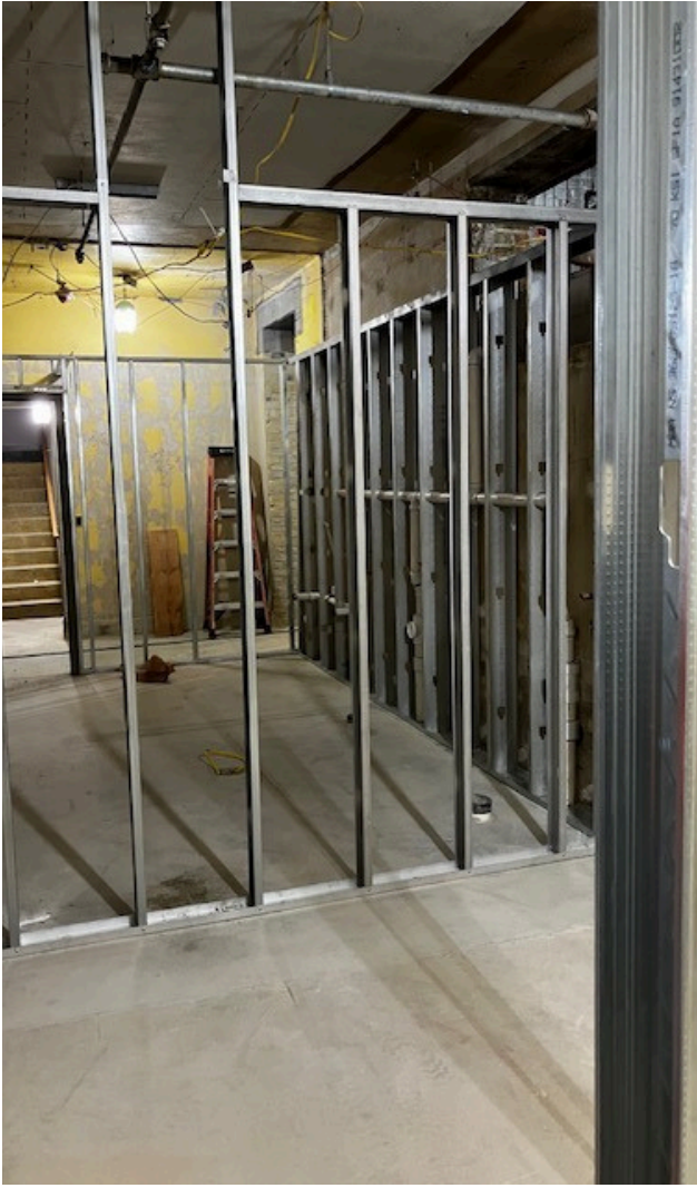
Partitions are being framed and sheetrock installed in the church basement. In the foreground are two storage rooms. At the rear of the photo is the new Women's Restroom.